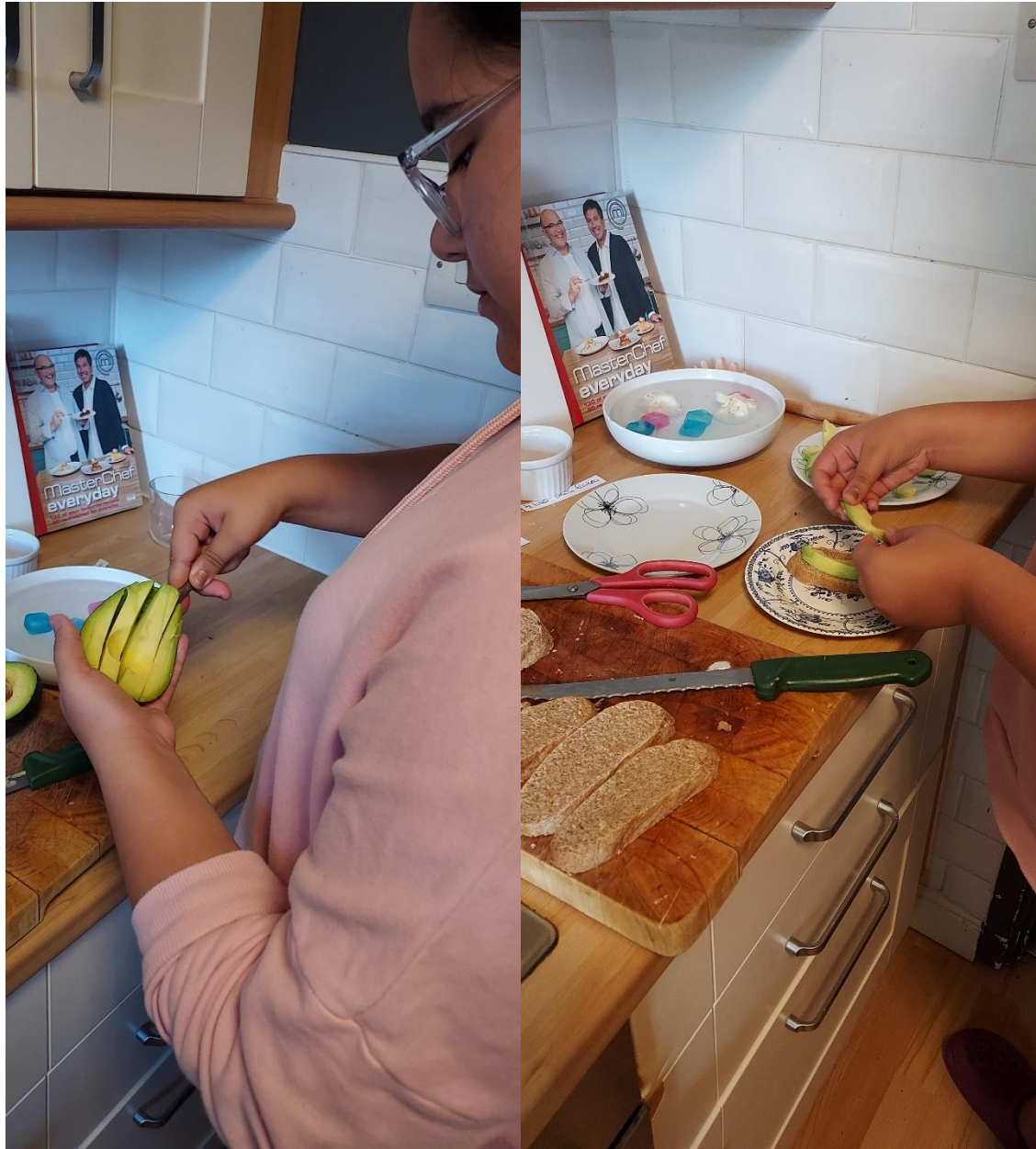
place sliced avocado on top,