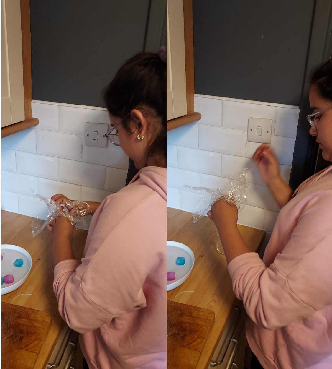
carefully remove cling film from the cup and seal at the top,