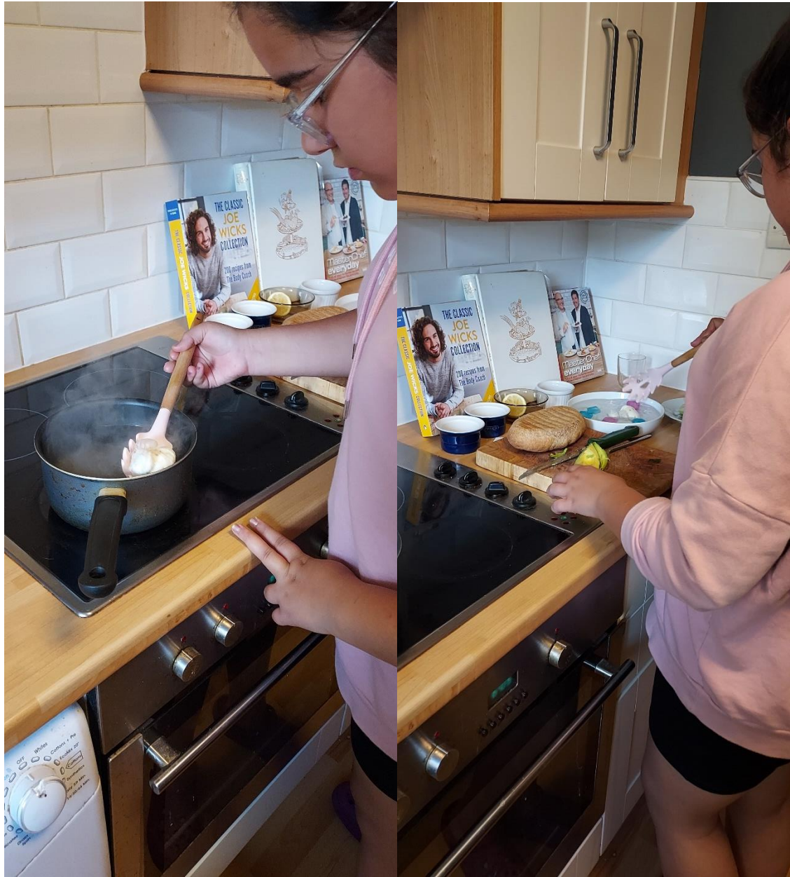
remove from the boiling water and place immediately in the ice water (this prevents the egg cooking more)