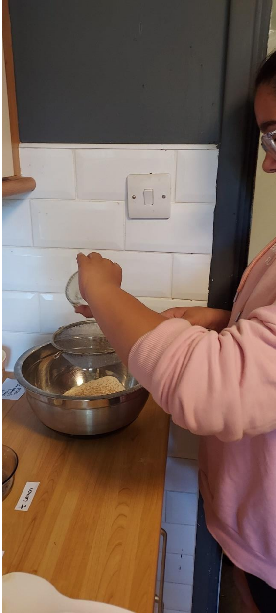
add the yeast,