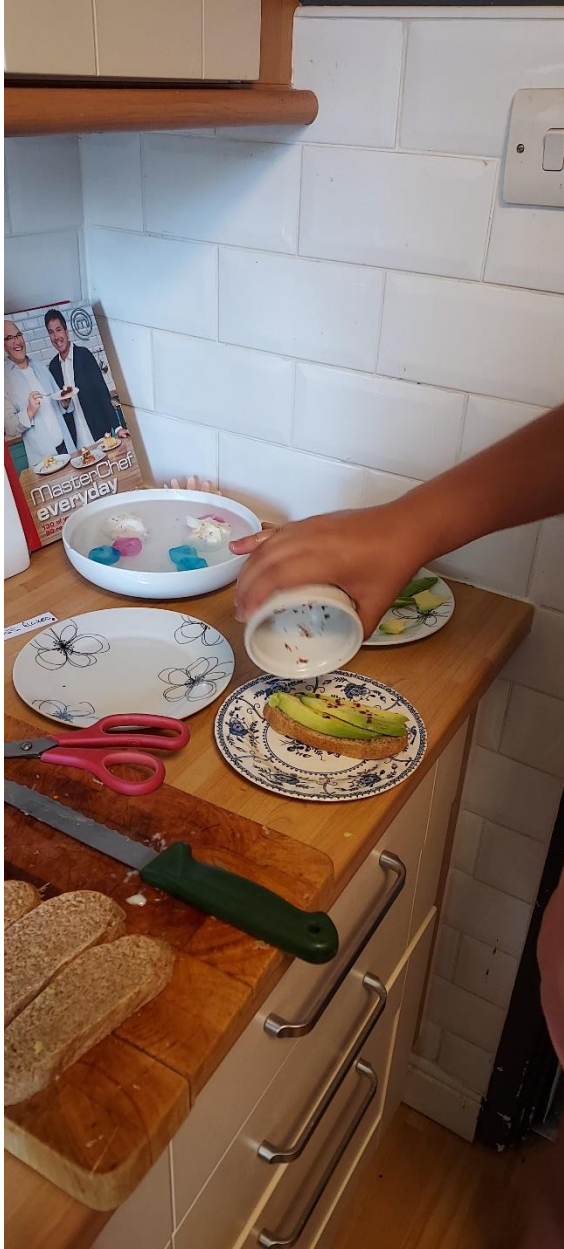
sprinkle a little chili flakes