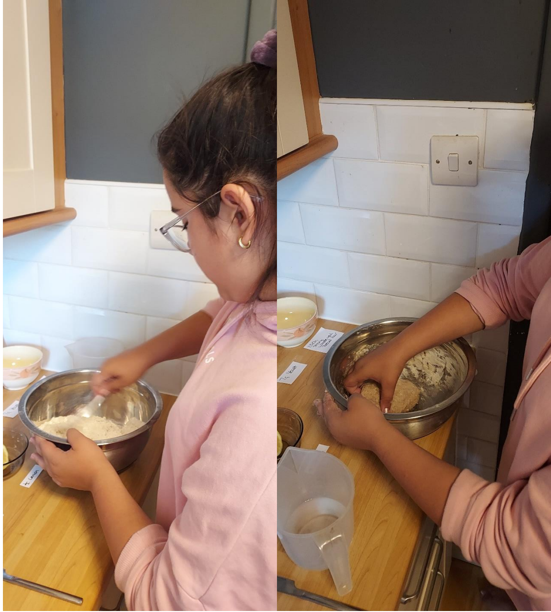
mix into dough consistency,