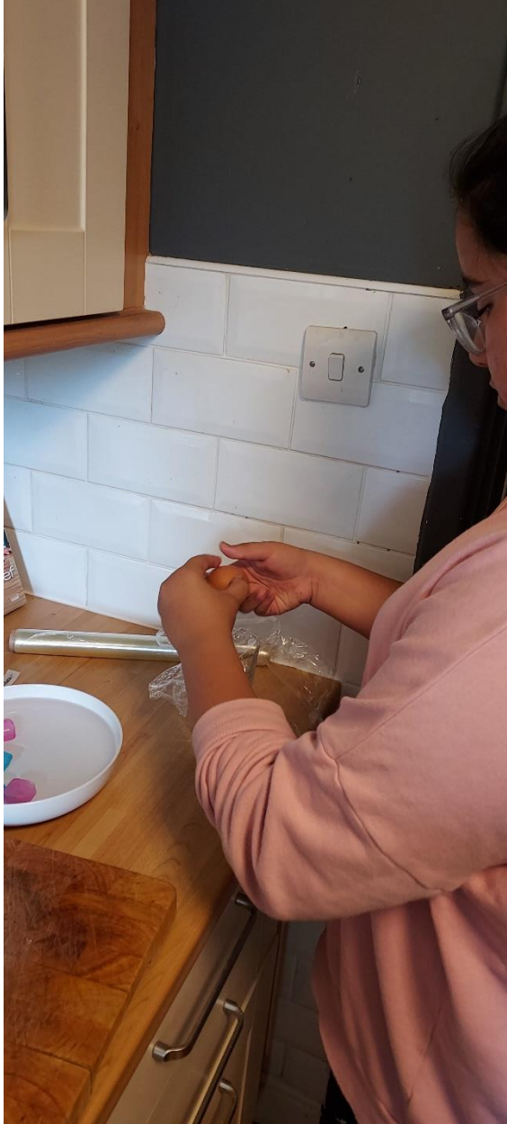
crack the egg into the cling film,