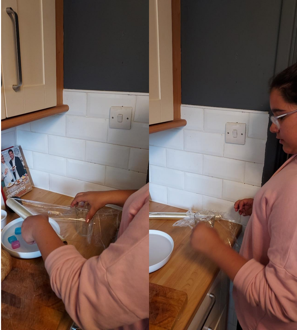
using a glass cover the top with cling film and using your fingers make an indent for the egg,