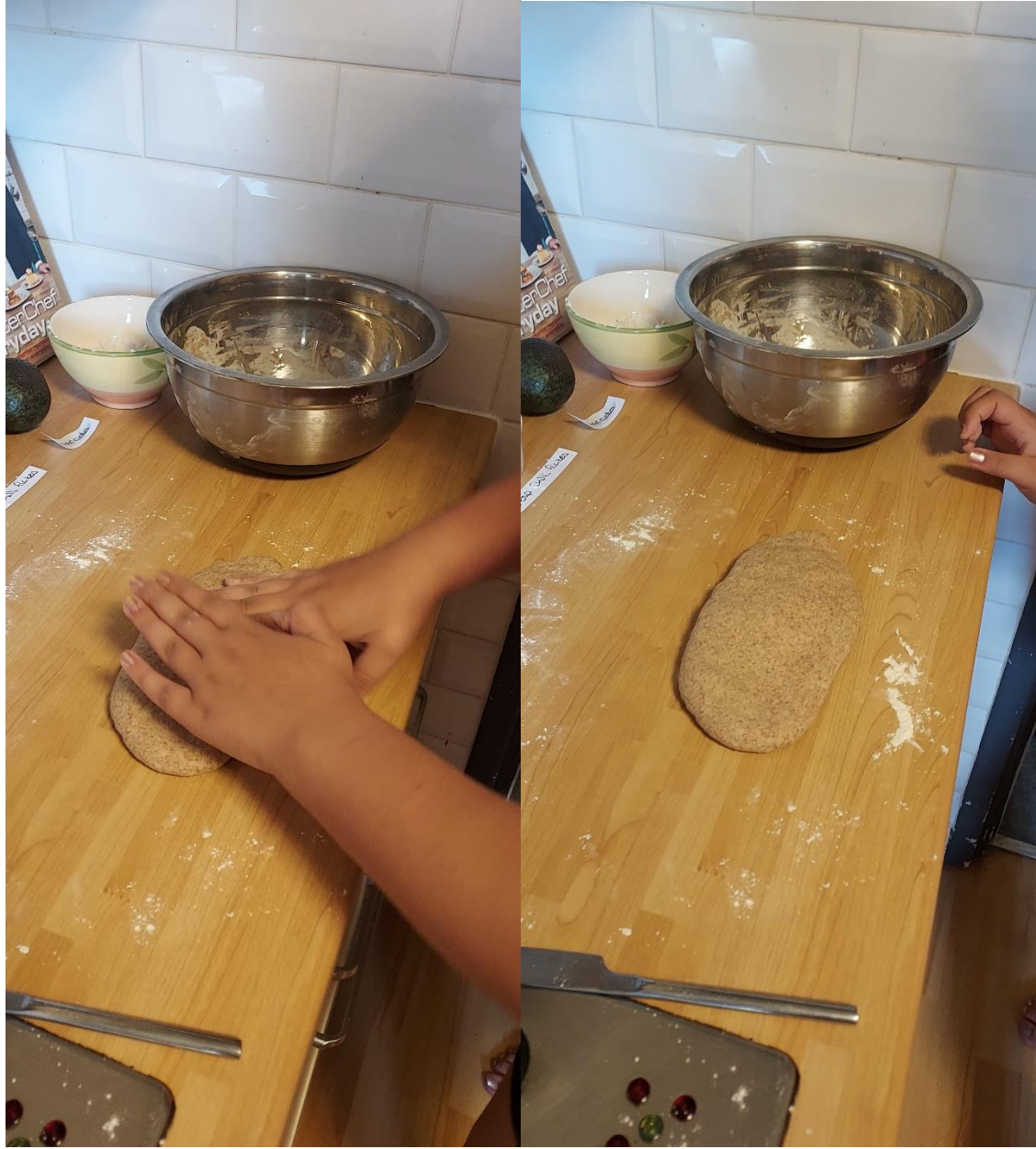
shape dough into a loaf