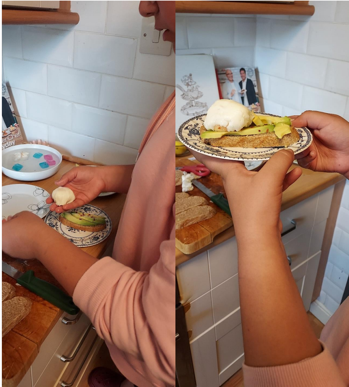
and remove egg from cling film and place on top.