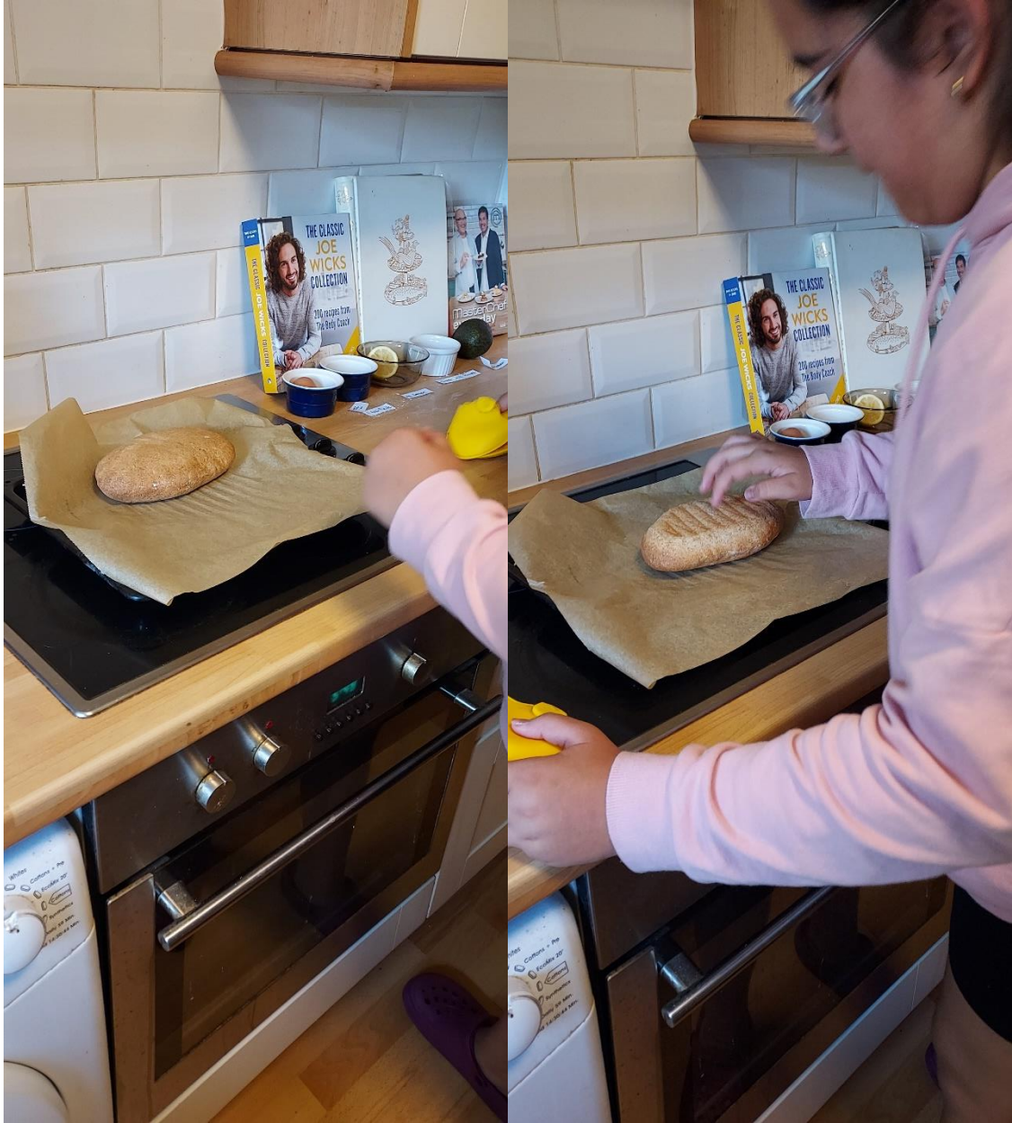
remove bread from oven, to check cooked, tap on bottom, should sound hollow.