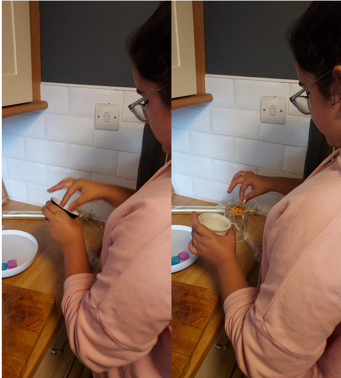
add a pinch of salt and chili flakes,