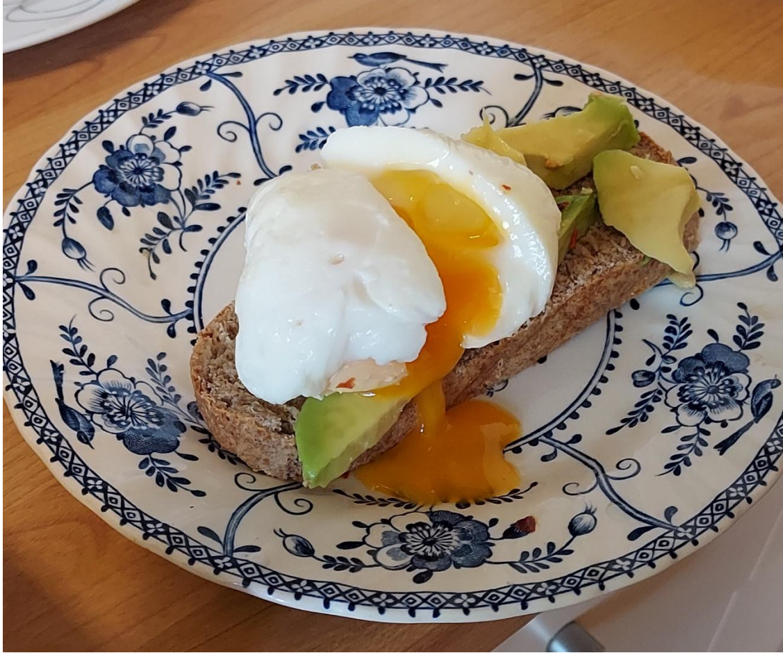
TASTY AVOCADO ON TOAST TOPPED WITH A SPICED POACHED EGG