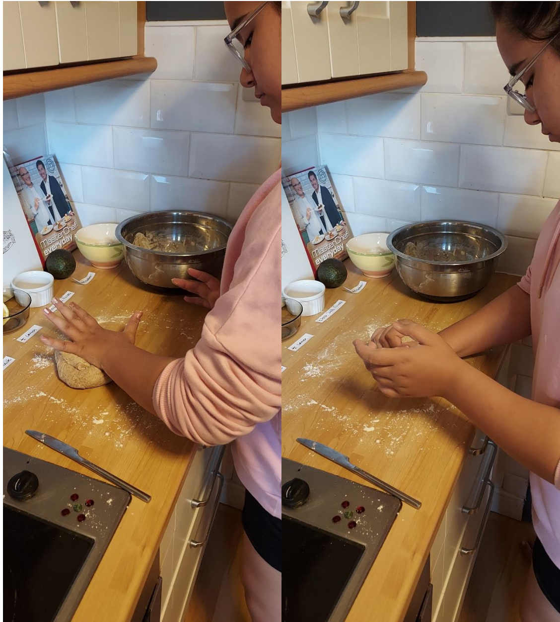
Sprinkle some flour onto the worksurface, remove the dough from the bowl and knead for 2 minutes,